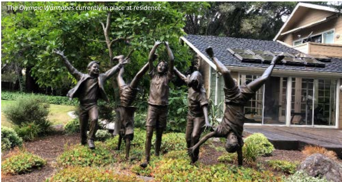
The Olympic Wannabes currently in place at residence