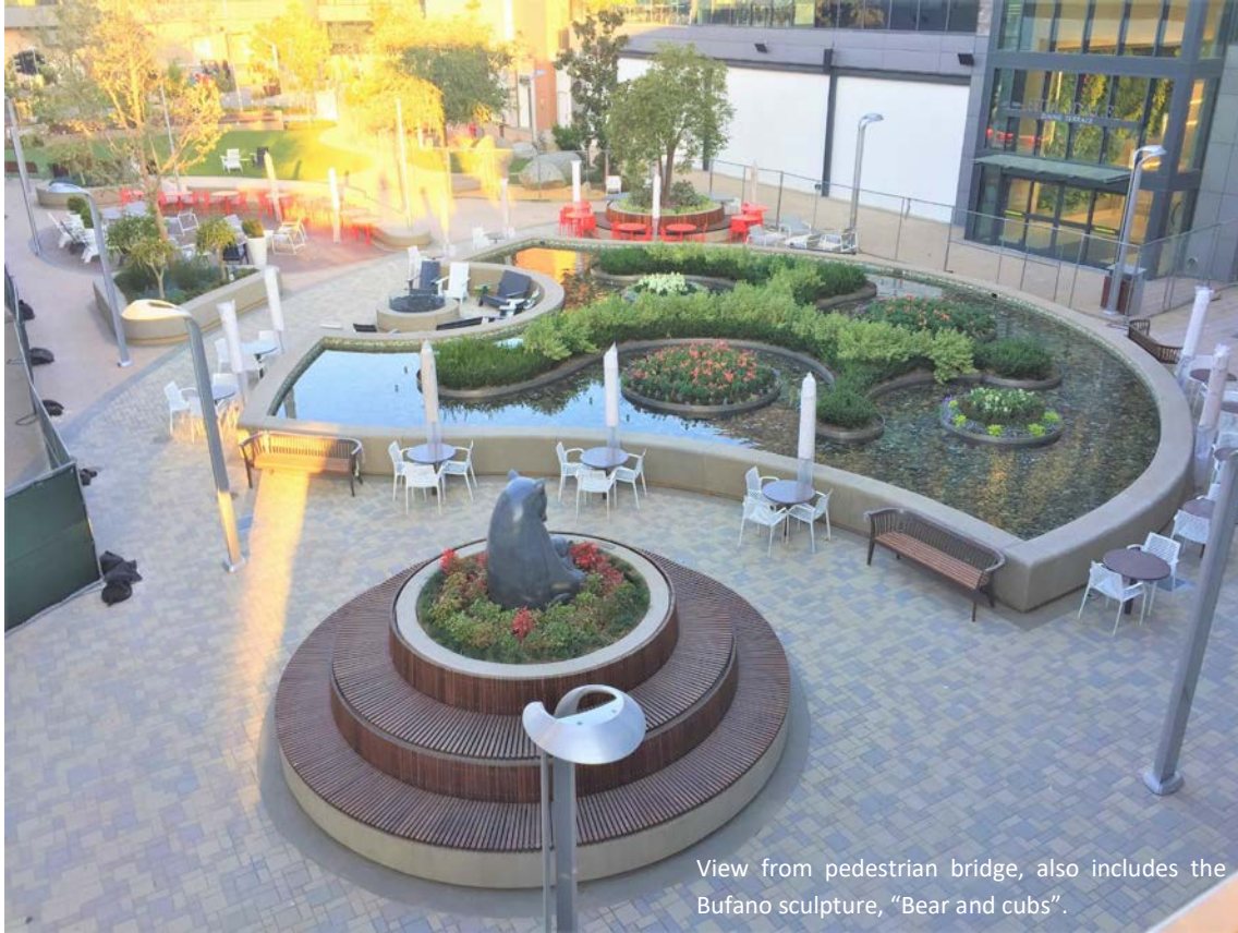
View from pedestrian bridge, also includes the Bufano sculpture, "Bear and cubs".

HILLSDALE SHOPPING CENTER, 60 31 ST AVENUE, SAN MATEO