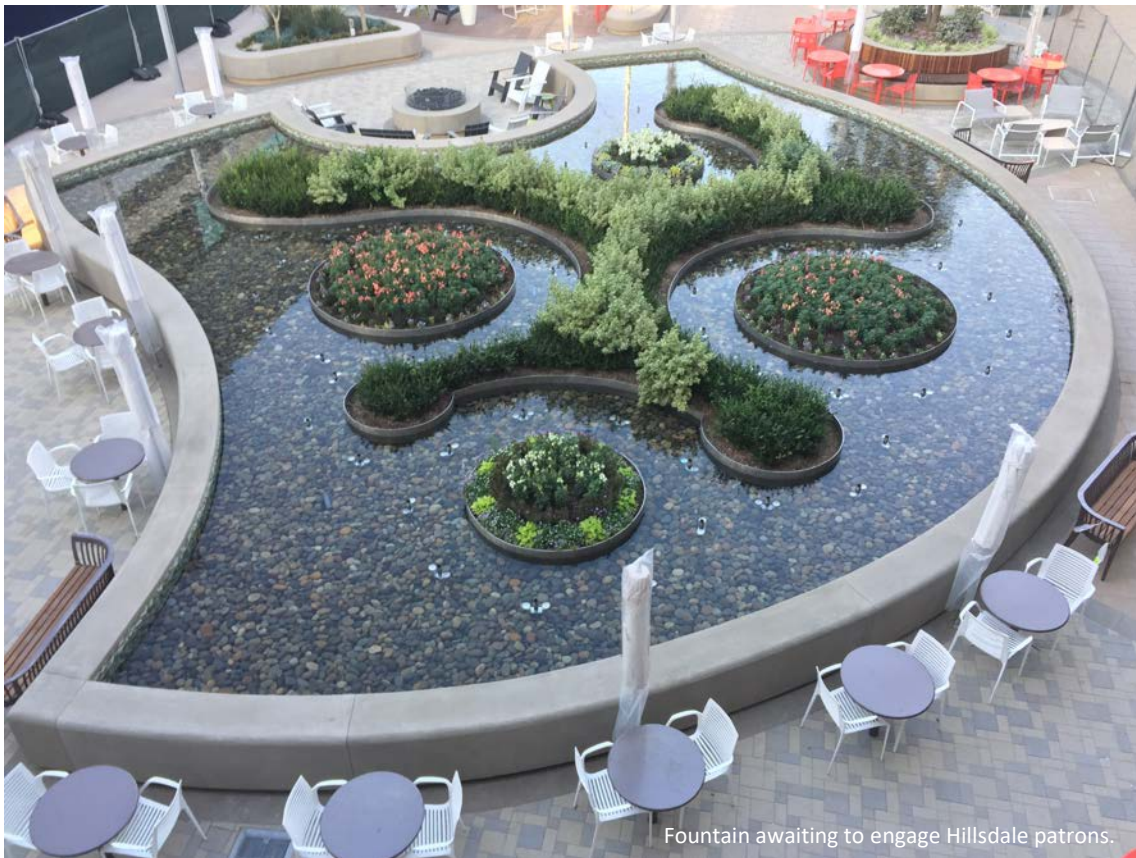
Fountain awaiting to engage Hillsdale patrons.

Artists: Lifescapes International, Inc. – Landscape Architects Approximate Fountain Dimensions: Surface Area 1871 sq. ft. Perimeter 211' 9" Developers: Bohannon Development