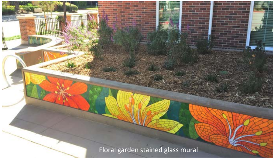
Floral garden stained glass mural