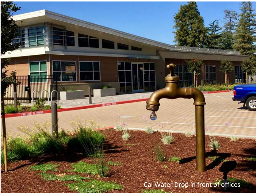
Cal Water Drop in front of offices