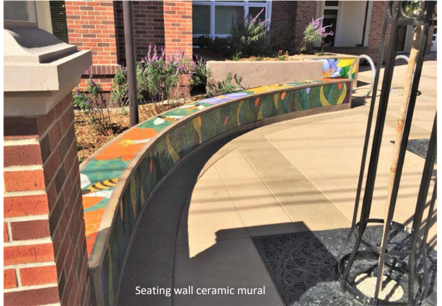
Seating wall ceramic mural

The planter mosaic was created in vibrant stained glass. Stained glass was chosen for the planter mural due to the broad range of layered, striking colors available, and the subtle reflective quality of glass that creates a sense of visual movement and light play as you pass by and during different times of day. The arched seat wall mosaic was created in exterior grade, glazed ceramic tile that compliments the glass colors in the planter mural. Ceramic tile was selected for the seat wall as it is appropriate for the functional nature of the installation while offering brilliant colors.