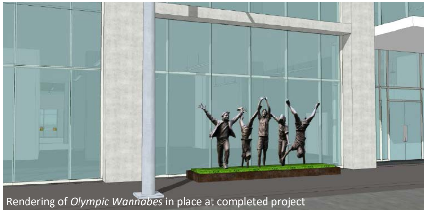
Rendering of Olympic Wannabes in place at completed project

"The concept of Olympic Wannabes emerged from Goodacre's observation of children enthusiastically watching the 1996 Olympics, specifically gymnastics. She thought of all of the children around the world doing cartwheels, while aspiring to reach this highest level of athleticism. Thus, the five poses are modeled off the various stages of cartwheels, providing a complex and interesting composition. She grappled with the challenge of balancing the movement of the five figures with an air of light playfulness. She accomplished this through the invisible base that is secured underground, making the children appear as though they are floating, frozen in the graceful movement of a cartwheel."